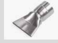
Wide slot nozzle 70 x 4 mm Article No: 107.261