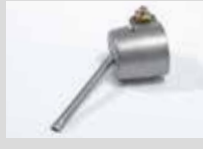
Soldering nozzle Ø 3 x 1.5 mm, oval Article No: 107.148