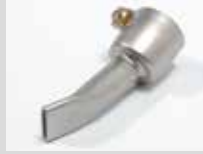
Wide slot nozzle 15 mm Article No: 107.141