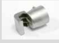
Soldering reflector 17 x 34 mm Article No: 107.325