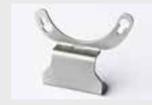
Tool stand only for ELECTRON ST Article No: 151.068