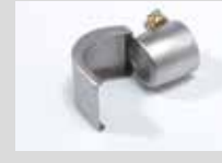
Spoon reflector 25 x 30 mm Article No: 107.312