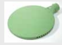
Welding mirror 270 mm, PTFE coated Article No: 107.346