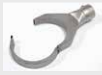
Folding reflector 125 x 22 mm Article No: 107.330