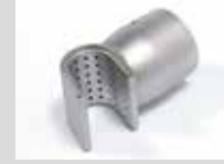
Sieve reflector 35 x 20 mm Article No: 107.309