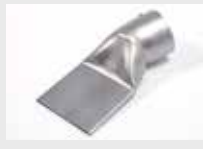
Wide slot nozzle 75 x 2 mm, Ø 50 mm Article No: 107.653