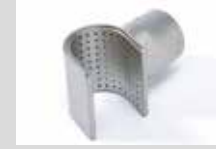
Sieve reflector 50 x 35 mm Article No: 107.308