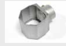
Folding reflector 60 x 75 mm Article No: 107.328