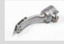
Ironing nozzle 15 x 25 mm Article No: 107.305