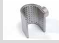
Sieve reflector 50 x 35 mm Article No: 107.311