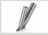
Speed welding nozzle *, with small air-slide, Ø: 3 mm / 4 mm / 5 mm Article No: 105.431 / 105.432 / 105.433