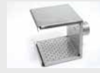
Sieve reflector 150 x 130 mm Article No: 107.333