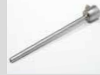
Extension nozzle Ø 5 x 150 mm, straight Article No: 105.567