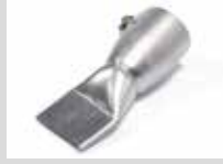
Wide slot nozzle 40 mm Article No: 106.999