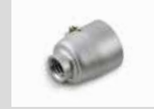
Nozzle adapter for screw-on nozzles Article No: 143.831